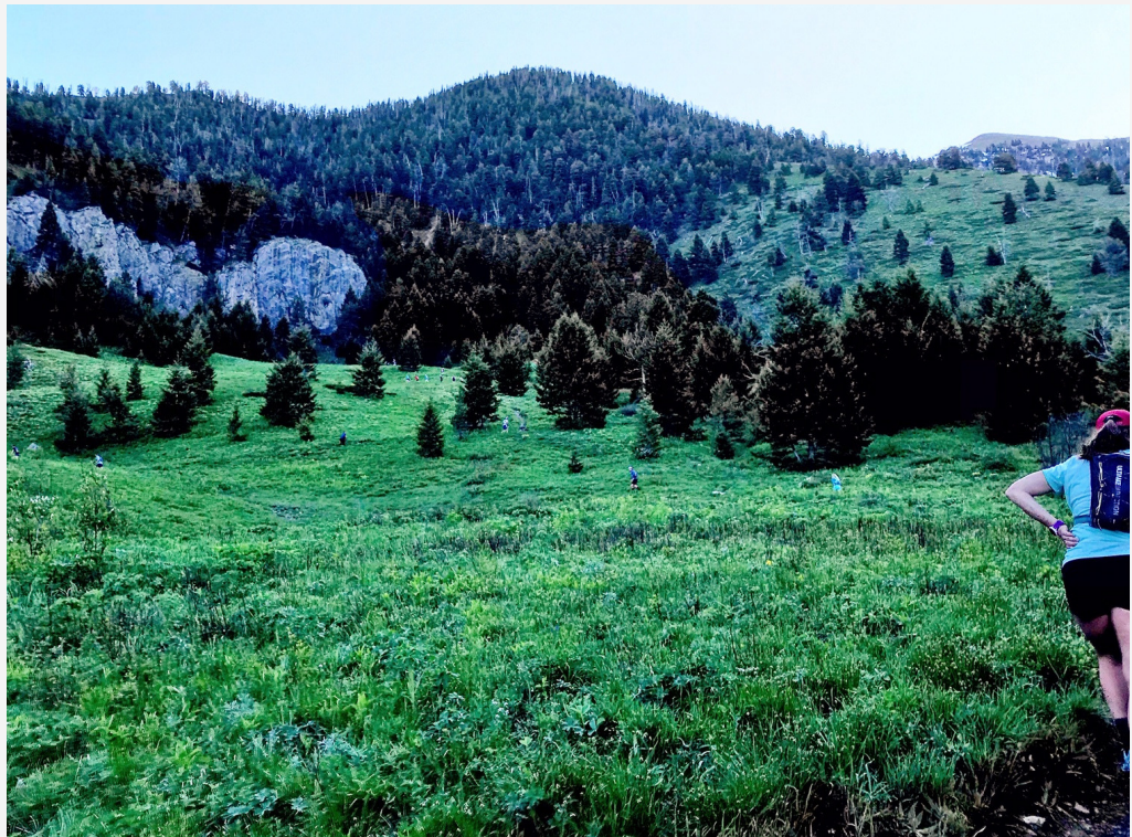
Early morning runners doing Old Gabe on June 15th. There were a ton of mountain goats spectating from the side of the ridge!